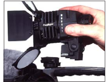
Detachable power base

Paglight is a revolutionary camera light, the first specifically designed to suit professional ENG/EFP requirements, and answer the many requests for an all-embracing, single operator camera light.