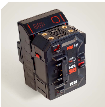
The MPL99G is smaller than the PL94 battery and the two can be linked.