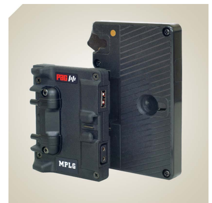
New, smaller PAG Mini Gold Mount for smaller cameras.